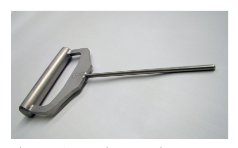
The BFM® 'TR Release Tool'.

It is important to note that the BFM® TR connector fits very firmly in place and that caution must be used when inserting and removing the connectors.