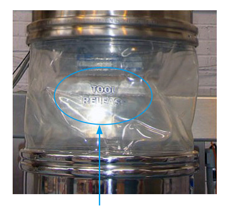
The BFM® TR (tool release) 040E and 040AS fittings have an embossed identifier stamp to make them easy to differentiate from our standard fittings.